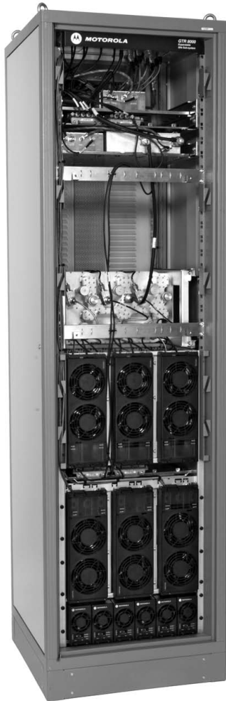
GTR 8000 Expandable Site Subsystem

G-series site equipment products provide feature-rich capability for ASTRO 25 mission critical radio systems. G-series software-defined base radio and site equipment platform allows customers to easily upgrade to future features. Motorola will be developing additional capabilities and functionalities that can be easily added to the station via a software upgrade. The G-series stations are flexible to meet customer's needs for site equipment. It is available in the following configurations: