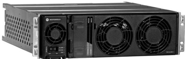
GTR 8000 Base Radio / GCP 8000 Site Controller / GCM 8000 Comparator